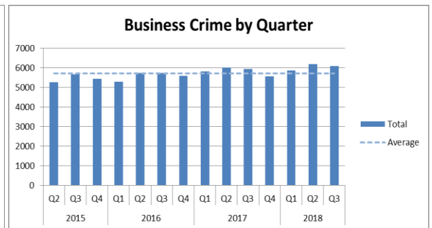
Chart 1 - Business Crime by month and quarter